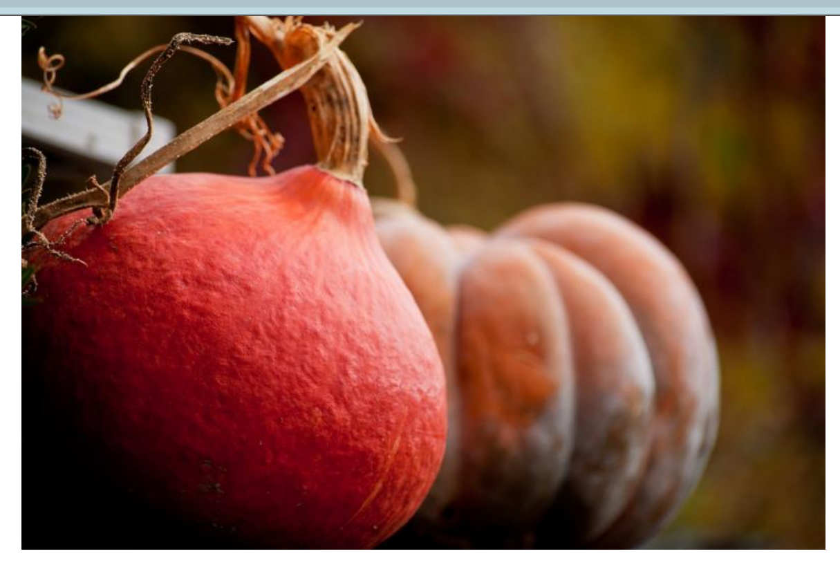
On to October!

Last month, I confessed fall is my least favorite season, and asked you to explain why I should do more than endure it. And boy, did you! You'll see a sampling of comments on my blog. Thanks to everyone who chimed in--it helped. I also realized when I was at the local farmers market last week that I love fall veggies, especially all the squash varieties. Yes, you can now get them year-round, but they never taste as good during the rest of the year, do they? Thanks again!